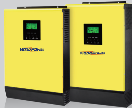
InfiniSolar V II-1.5KW InfiniSolar V II-2KW / 3KW/5KW